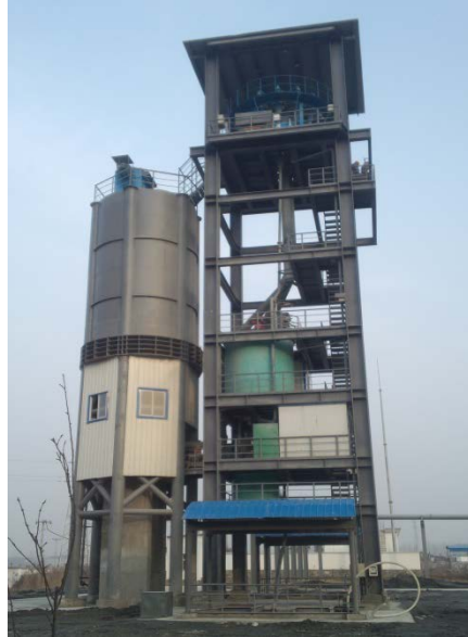
Figure 3. Flow chart of short-processing tailing-storage-free filtration backfilling and filling station