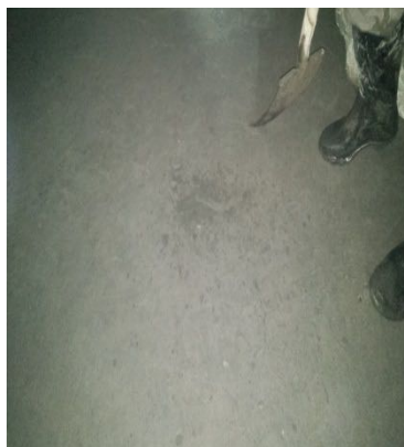
Figure 5. Solidified filling body with underground stopes