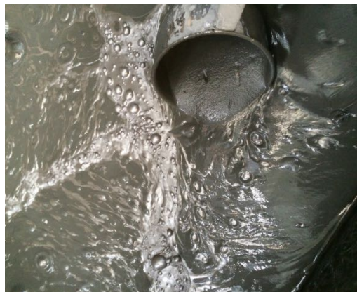
Figure 4. Filling paste inside boreholes (already added cement and fully mixed)